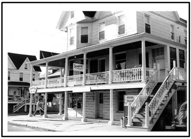
The former "Scott House" as it appeared in 1966, viewed from Caroline Street.