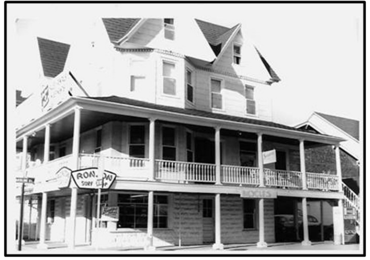
Another view of the former "Scott House" taken in 1966.

"But when you look at things in a long way the era of the railroad was pretty short. It started in [1875] and wound up in 1933 – a period of [58] years. Of course, the railroad wanted to discontinue service long before the hurricane of '33 washed away the bridge. Why, I sold only two tickets to passengers in May of 1933, and in June of that year, a vacation month, I sold just five tickets.