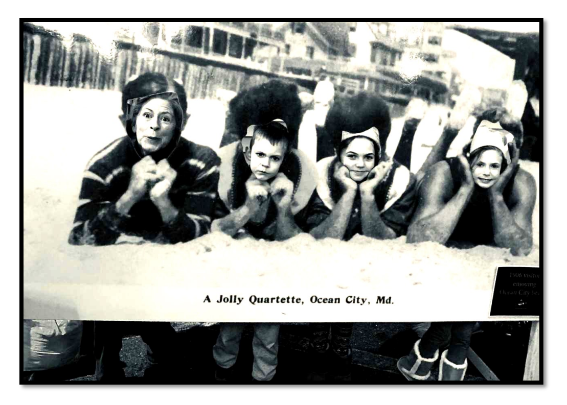
Our Winterfest display featured an enlarged vintage postcard with cut outs for making fun holiday portraits