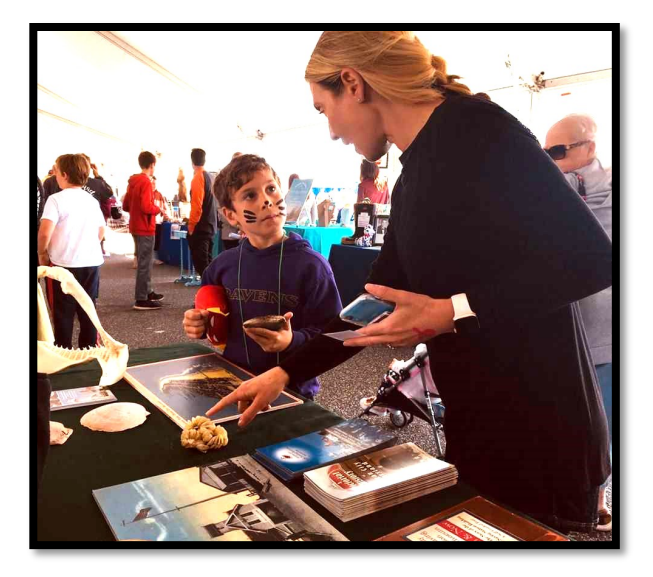
Pip the Beach Cat was a special guest during our Little Learners Program on October 28, 2019