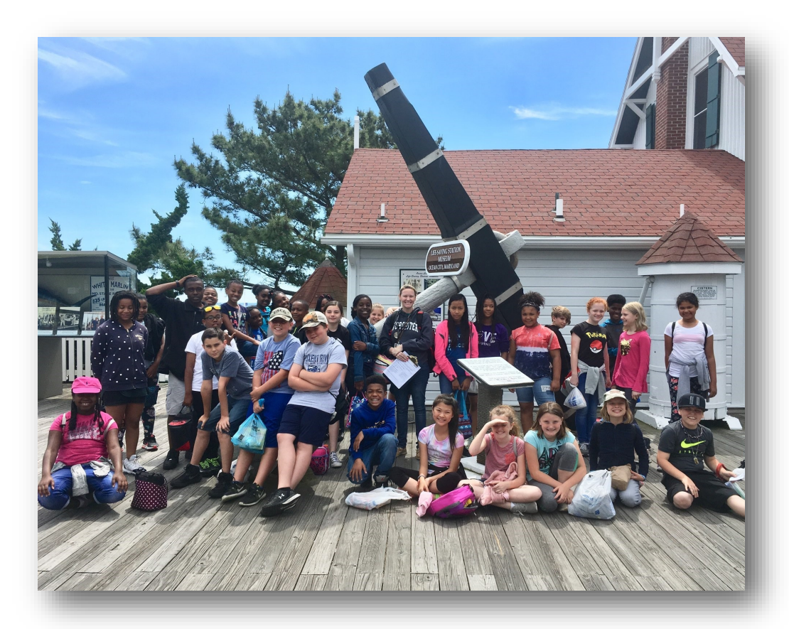
Pocomoke Middle School enjoyed a field trip to the Museum on May 22,2019