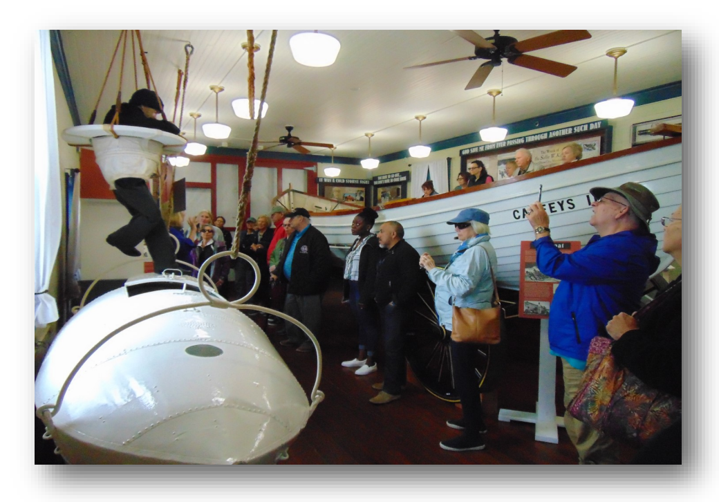
A tour group from the Harrison Group gets an orientation in the Boat Room