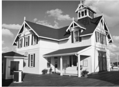
The Ocean City Life-Saving Station Museum

the total collections and physical plant applies to all holdings of an institution that fall under the same budget, board of directors, and museum director. The assessment report will assist the museum by providing recommendations and priorities for conservation action, both immediate and long-term, facilitating the development of a long-range conservation plan for the care and preservation of the collections, and serving as a fund-raising tool for conservation projects.